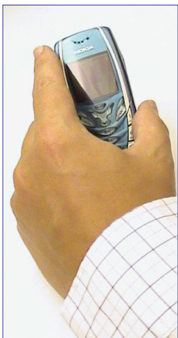
Accuracy within 100m in some urban areas